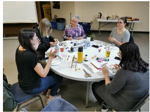
Making fish leather here ☺