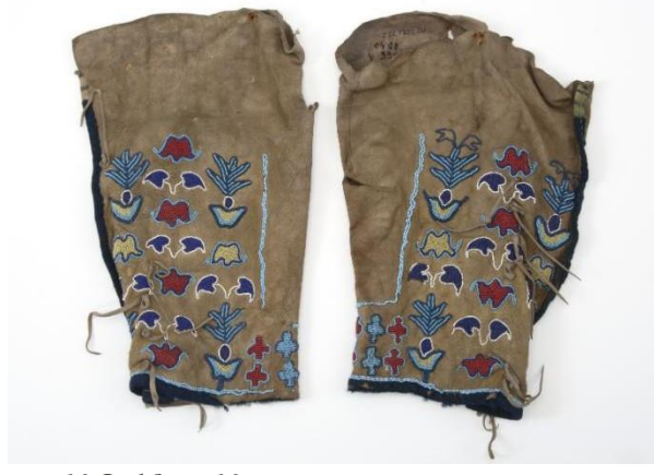
McCord Stuart Museum