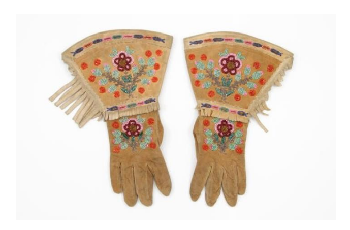
McCord Stuart Museum