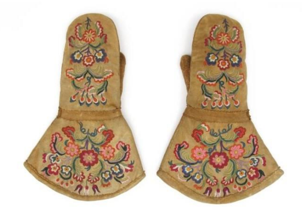
McCord Stuart Museum